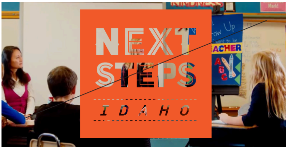
DO NOT place the logo over a busy background