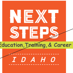
DO NOT add text to the logo