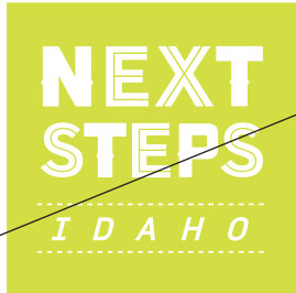
DO NOT change logo colors