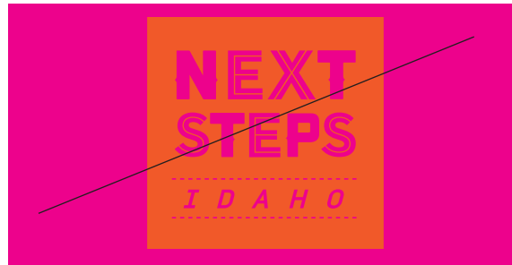
DO NOT place the color logo over solid fields of clashing color