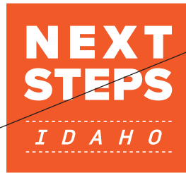
DO NOT change the logo fonts