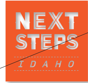
DO NOT add effects to the logo