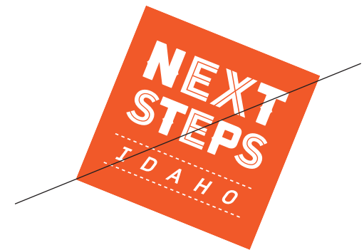
DO NOT rotate or skew the logo